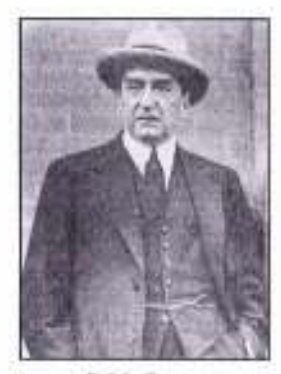
<u>S.M. Bruce</u> The Honourable S.M. Bruce brought in the Bill to amend the Commonwealth Bank Act.

At the official opening of the Commonwealth Bank in 1932, William Morris Hughes, the man who later became Australian Prime Minister and known offectionately at "the little Digger": said, "It (the Bank) stands here today as the ontward and visible sign of the wealth and substance of the whole, people. It is indeed Australia commercially translated in the terms of money. It is the symbol of our wealth; it will stand as long as we stand.