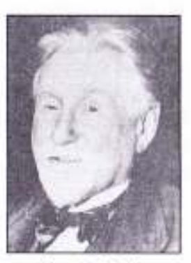
King 0 'Malley Compaigned vigorously to save the Commonwealth Bank